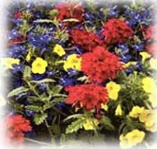
Primary Perfection Mix