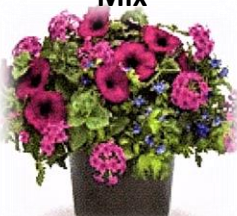
Night in Pompelli Mix