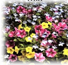
Pink Lemonade Mix