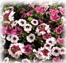
Cherry Blossom Mix