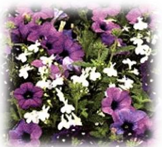
Grape Expectations Mix