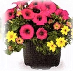
* Surfer Chick