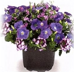
Blue Ridge Mix