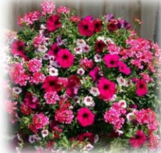
* Cherry Kiss