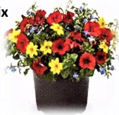
* Fire & Ice Mix