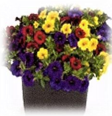
* Callie Color Wheel Mix