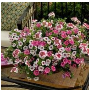
Rock and Roll Mix