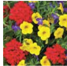
Primary Perfection Mix