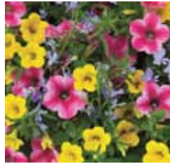
Pink Lemonade Mix