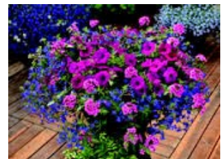
Nights in Pompeii

Get your order in before they are all gone!