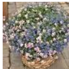
Shady Lady Mix