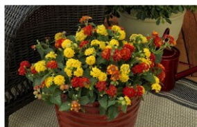
I Like it Hot