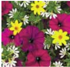
Royal Gold Mix