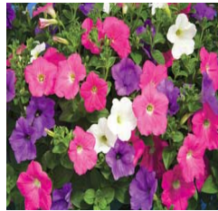
Sanguna Summer Cooler Mix